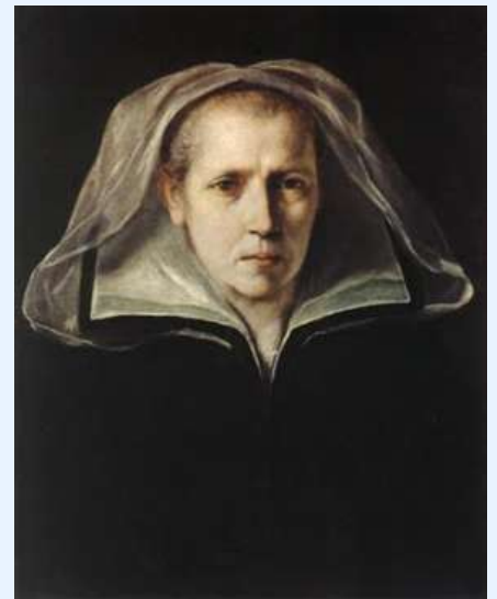
Guido Reni: High Baroque

This month we were intending trialling the larger venue to accommodate all members. However, problems arose as we went in to set up, the biggest being that the screen was disconnected and awaiting an electrician so, prior to everyone's arrival, we hastily set up in the bar - the best laid plans!!