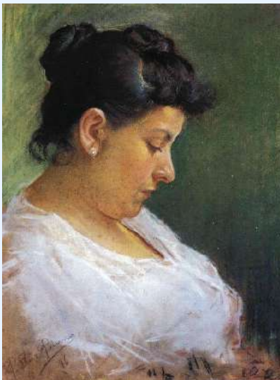
Van Gogh: Post-Impressionist

At our meeting at the end of March, however, we looked at Artists and their Mums, as Mothering Sunday was close by. We covered a wide selection of artists in different countries over an historic timescale as well as contemporary artworks, and from different movements. Artists both familiar and also perhaps unfamiliar - arresting, and even surprising, depictions were viewed, alongside information on their often very different relationships with their mothers.